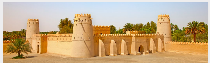
Al Ain Day Trip from Abu Dhabi with Lunch Henna Painting, & Camel Ride