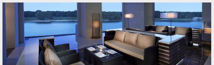
Anantara Eastern Mangroves Hotel & Spa

★★★★★ Eastern Mangroves, Al Salam Street