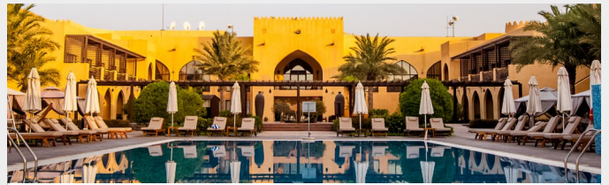
Tilal Liwa Hotel

★★★★★ Al-Gharbiya, Western Region, Madinat Zayed