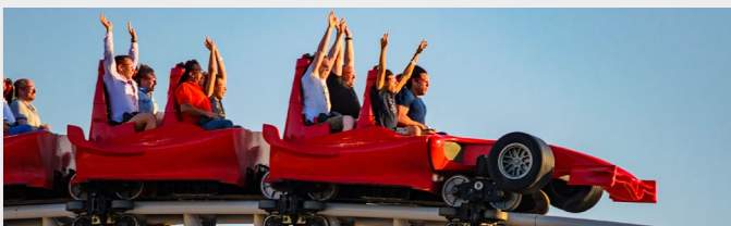
Entrance Ticket to Ferrari World in Abu Dhabi Henna Painting, & Camel Ride