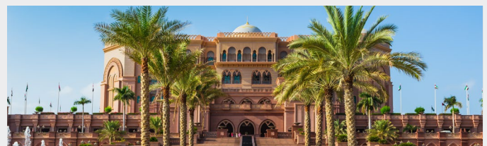
High Tea at Emirates Palace Henna Painting, & Camel Ride