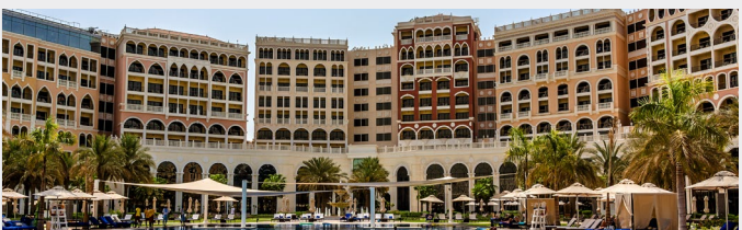
The Ritz-Carlton Abu Dhabi, Grand Canal