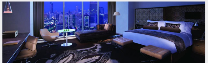
Jumeirah At Etihad Towers Hotel