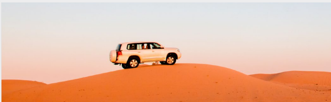
Evening Desert Safari With BBQ Dinner, Henna Painting, & Camel Ride