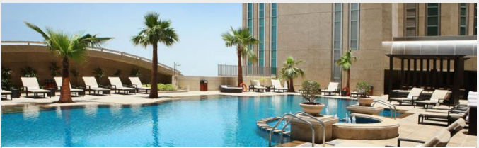
Sofitel Abu Dhabi Corniche

★★★★★ Capital Plaza Complex, Corniche Road East