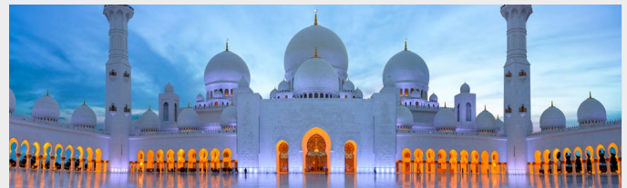
Abu Dhabi Sightseeing Tour: Sheikh Zayed Grand Mosque & Heritage Village Henna Painting, & Camel Ride